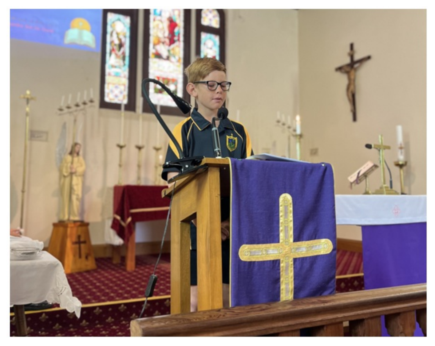
Project Compassion QR code for St Columba's Memorial School Campaign.